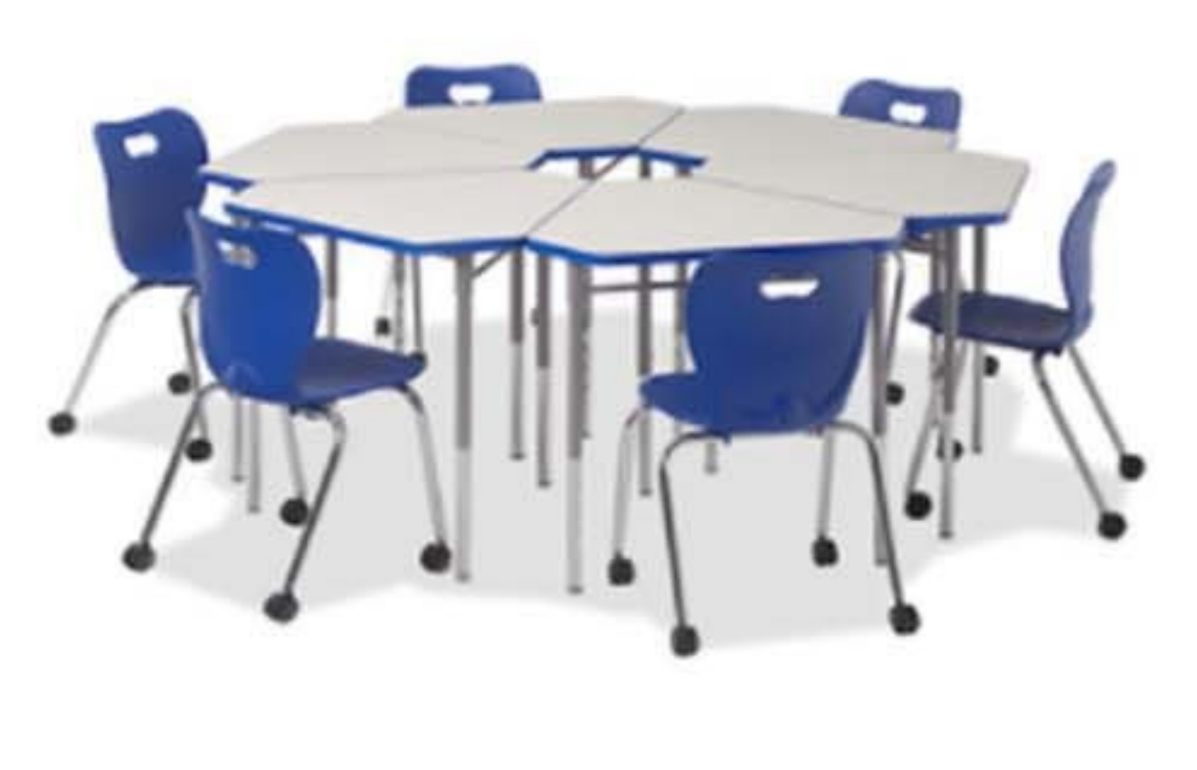
Tri 6 Desk