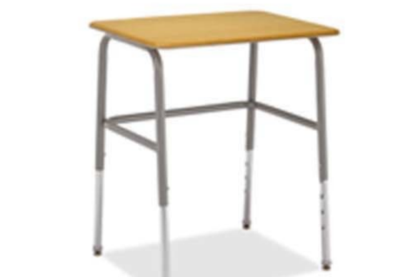
Rocky Mountain Sr. Desk