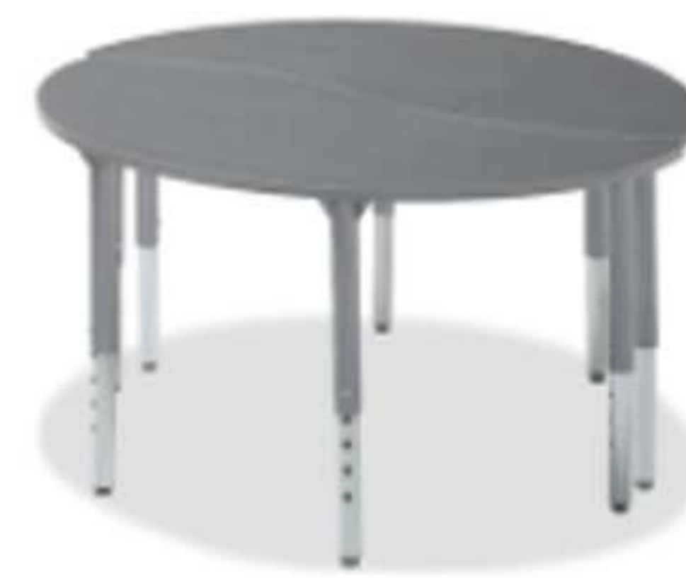
Ogee shown as pair to make a circle