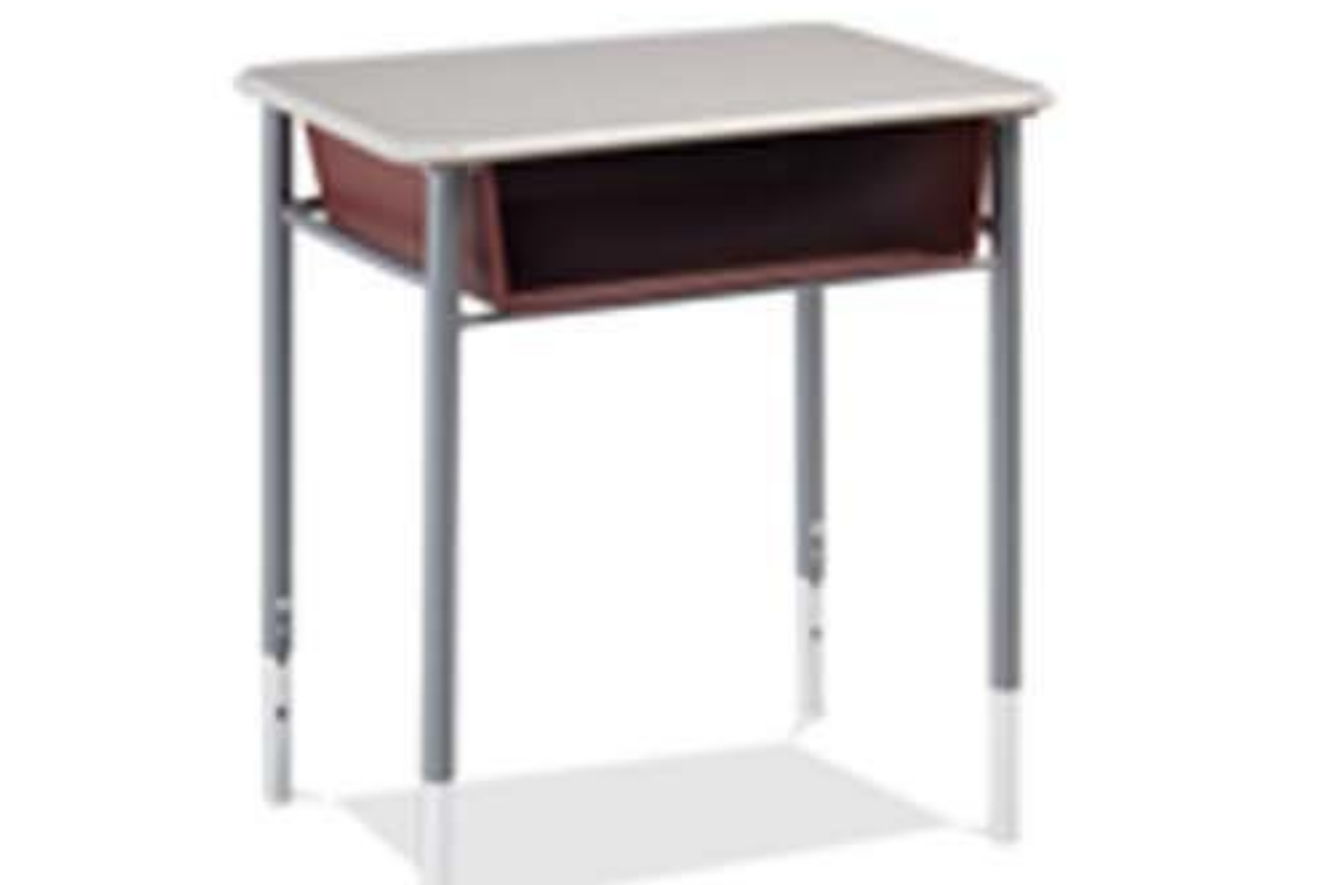
Rocky Mountain Jr. Desk