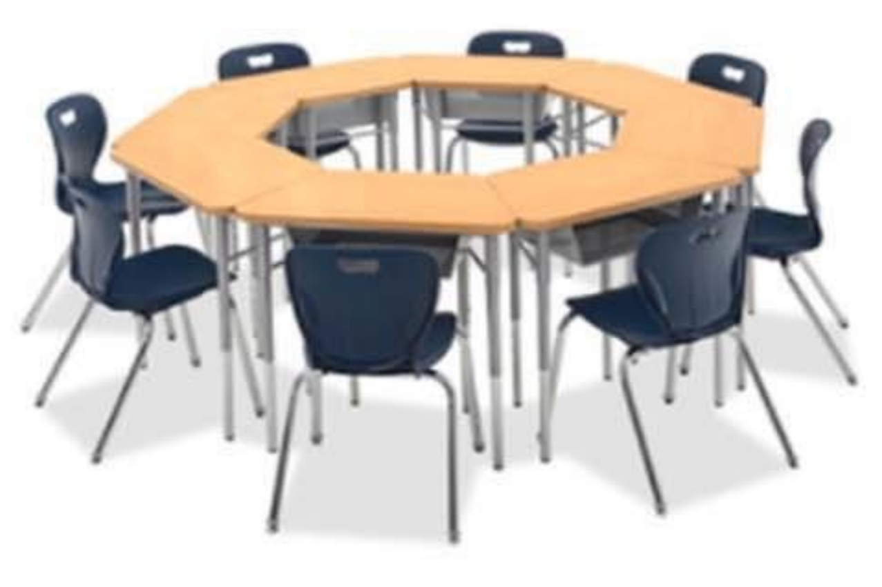
Trap 8 Desk